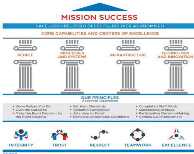
Figure 1- CNS Strategic Plan Model

CNS is committed to maintaining robust Environment, Safety, and Health (ES&H) programs, and has established safety as the first imperative of the corporation, as documented in the model (Figure 1) of the strategic plan.